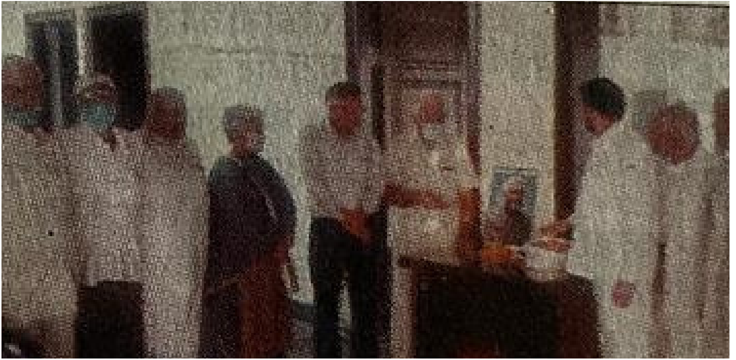
FORMER PRESIDENT DR. K. R. MEMBERS OF THE ASSEMBLY OFFERING FLOWERS TO NARAYANAN'S PORTRAIT.

Narayanan is regarded as an independent and outspoken President who set many precedents and widened the scope of India's highest constitutional office.